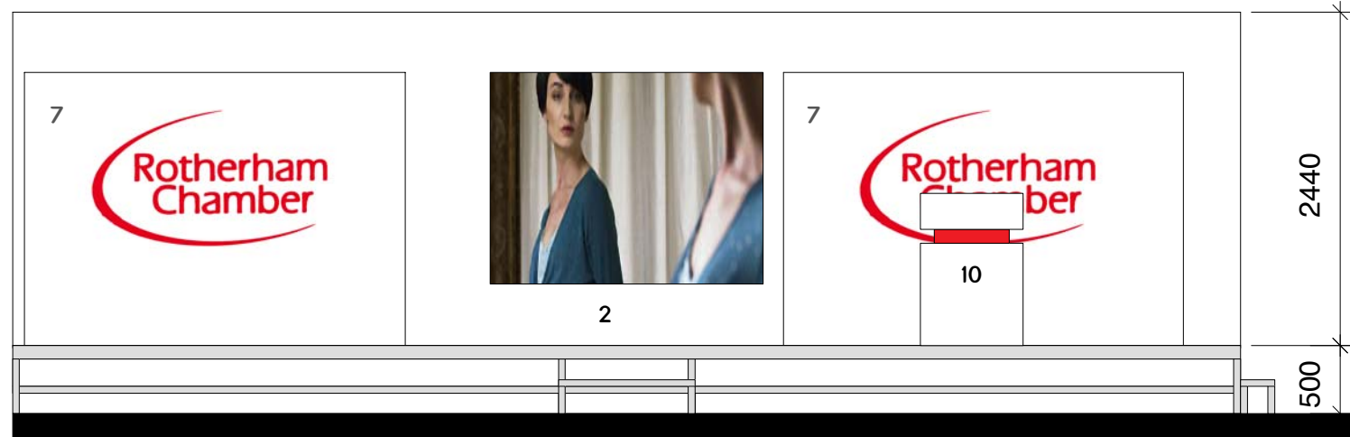
ELEVATION (WITH PANELS) AA